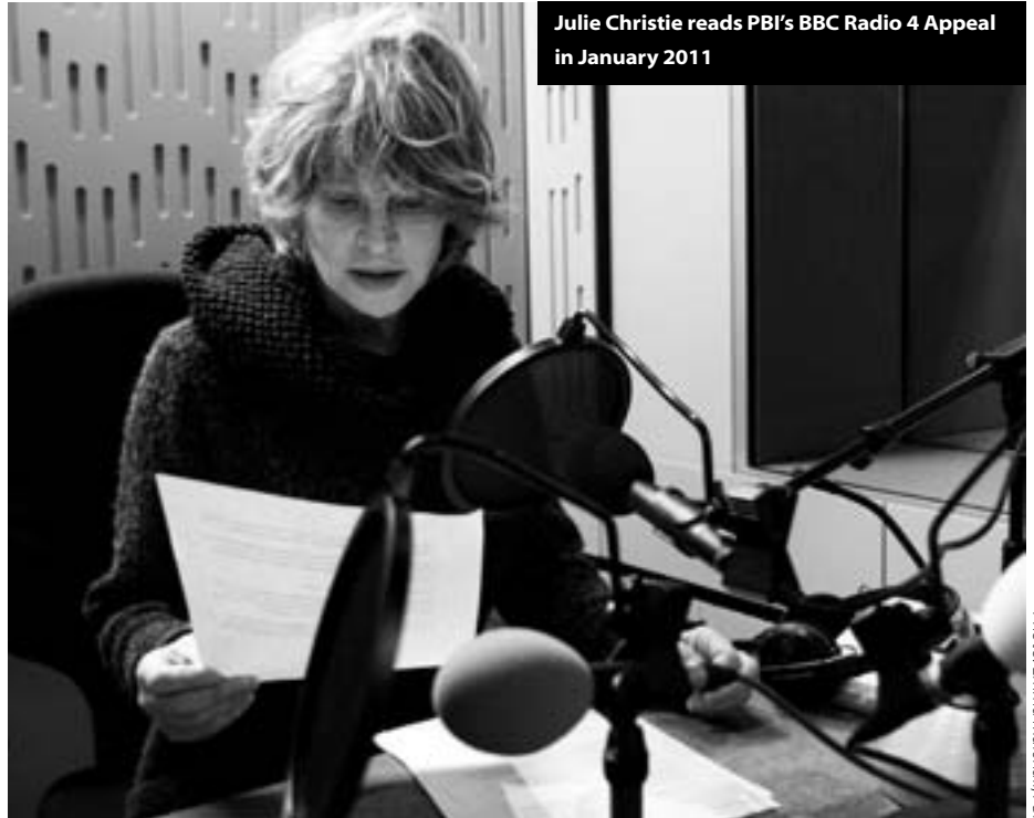
Julie Christie reads PBI's BBC Radio 4 Appeal in January 2011