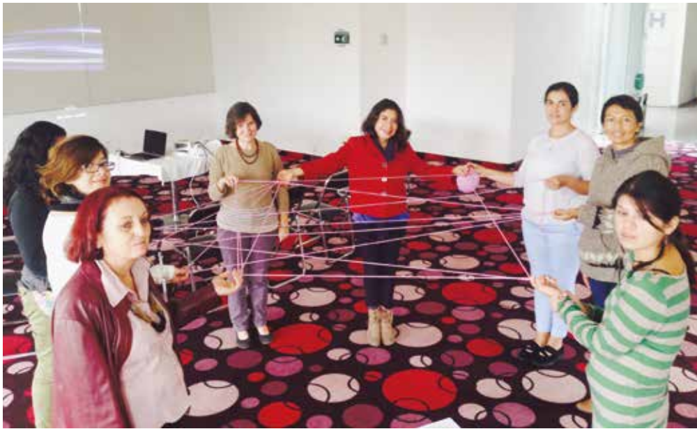
Workshop - Integral Protection Course for Women Human Rights Defenders, 21 September 2015, Mexico