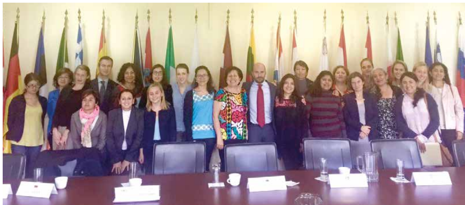
Roundtable of WHRDs and Embassies, 22 September 2015, Mexico

At the same time, PBI collected the testimonies and reflections of women defending human rights in Mexico. It was a further initiative to promote and increase understanding of the concept of integral protection, by drawing on the knowledge and experience of WHRDs themselves – 22 in total – expressed in their own words. This publication includes these testimonies as well as the learning points and reflections of the course participants.